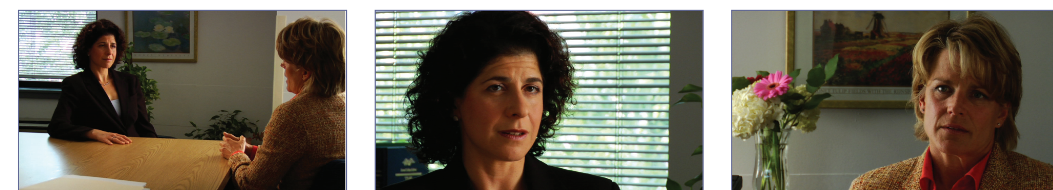
Educational objectives included knowledge, competence, and performance indices.